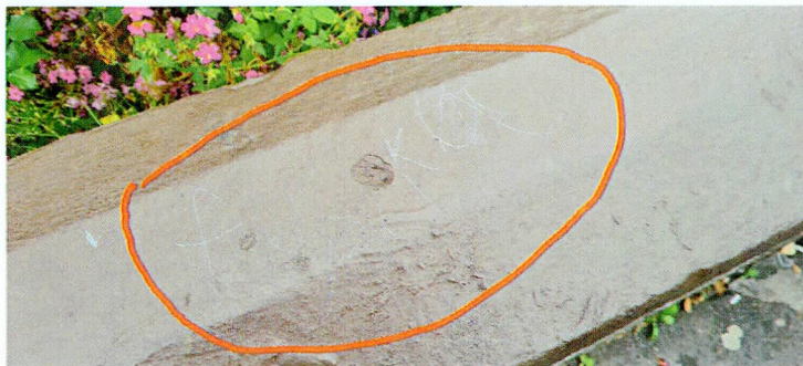
Figure 1: Antisocial behavior - please see pdf version for colour accurate picture

In addition to the above, the driveway to number 9 makes an ideal quiet area for people to take